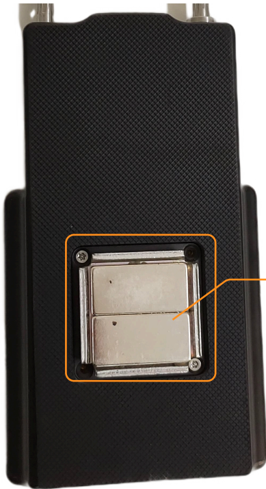
Magnet (The device to stay and fix its place)